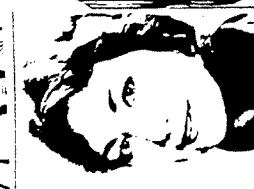
Adores the minuet, the Ballets Russes, crepes Suzette