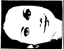
Goes for rock and roll; a hot dog makes her lose control

Diviant Behavior. The musical misadventures of Carol Vanness and Cheryl Strudel, two opera stars no one can tell apart. Tonight, the girls play a practical joke on guest star Thomas Hampson. Carol: Nora Dunn. Cheryl: Kathy Najimy. Vocal highlights: "Autumn in New York" (Carol); "Moonlight in Vermont" (Cheryl); "Dove sono i bei momenti" (Both); "Sempre libera" (Neither) Not on NBC's fall schedule.