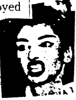
Régine Crespin sang Mme. de Croissy in Joseph Machlis' 1977 transcription of Dialogues of the Carmelites